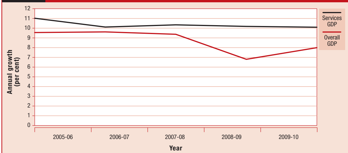
Figure 10.1 Growth rate of GDP and services sector GDP